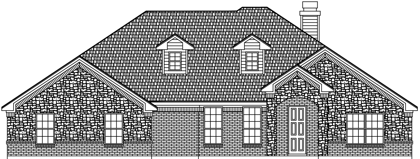
SPEC CFE 2456 / 1916 JANA WAY

YOUR CUSTOM HOME BUILDER LOCALLY OWNED & OPERATED